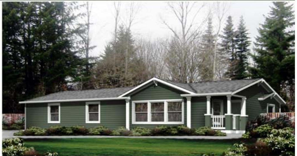
MODEL 58734 1,531 Sq.Ft.

We have two versions of our Anniversary Edition plan. In this version we simply reversed the bedrooms and utility room to provide for home sites that work better with a garage on the back rather than front side of the home. This moves the hallway to the opposite side as well creating additional living room floor space and slightly altered kitchen. All other features and available options remain identical in either Casual Elegance plan.